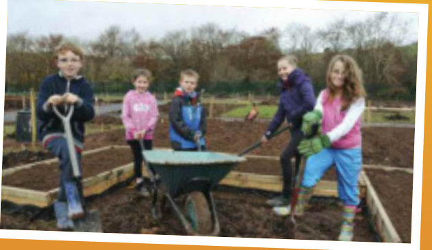
Local children pictured at the official opening of the Regional Park Allotment Scheme in Ballincollig, a project undertaken by Cork County Council in partnership with the community. Officially opened in 2013, it provides over 40 allotments and is the first amenity of its kind in County Cork. The project received €123,750 in RDP funding through SECAD.