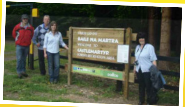
The opening of the woodland trail project through Pigeon Woods and Mitchell's Woods in Castlemartyr. Castlemartyr Community Council received €21,100 in funding from SECAD Rural Development Programme developing the trail on Coillte land.