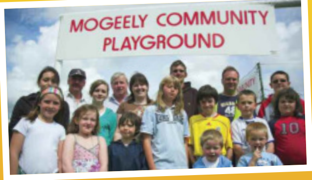
Pictured here members of the Mogeely Community group which SECAD funded €92,000 grant aid for the redevelopment of Mogeely Playground.