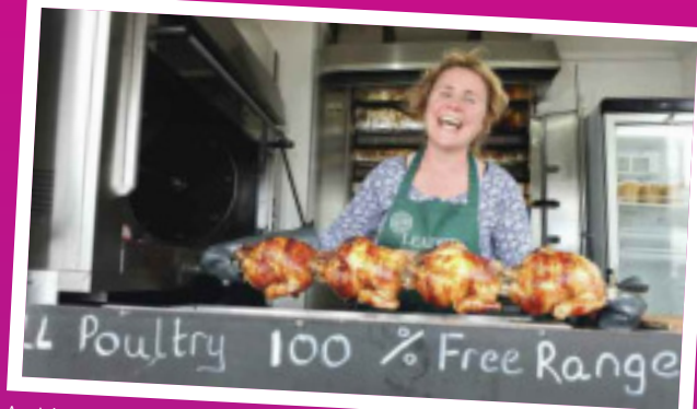
Annie's Roasts sells free range locally produced poultry roasted fresh on site. SECAD contributed a grant towards the purchase of a rotisserie and other equipment which enabled Annie's Roasts to sell at Farmers' Markets.