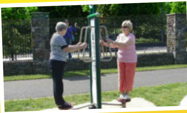
Two ladies using the outdoor adult gym in Carrigaline, the Carrigaline Active Retired Association received €8,330 from SECAD to purchase and install eleven different pieces of outdoor exercise equipment.